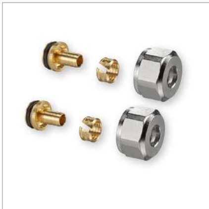
Compression fittings “Ofix K”