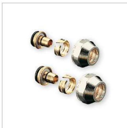
Compression fittings “Cofit S” for composition pipe “Copipe”