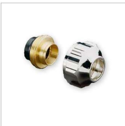
Compression fittings “Ofix CEP” “Snap & Seal”