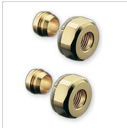
Compression fittings “Ofix CEP”